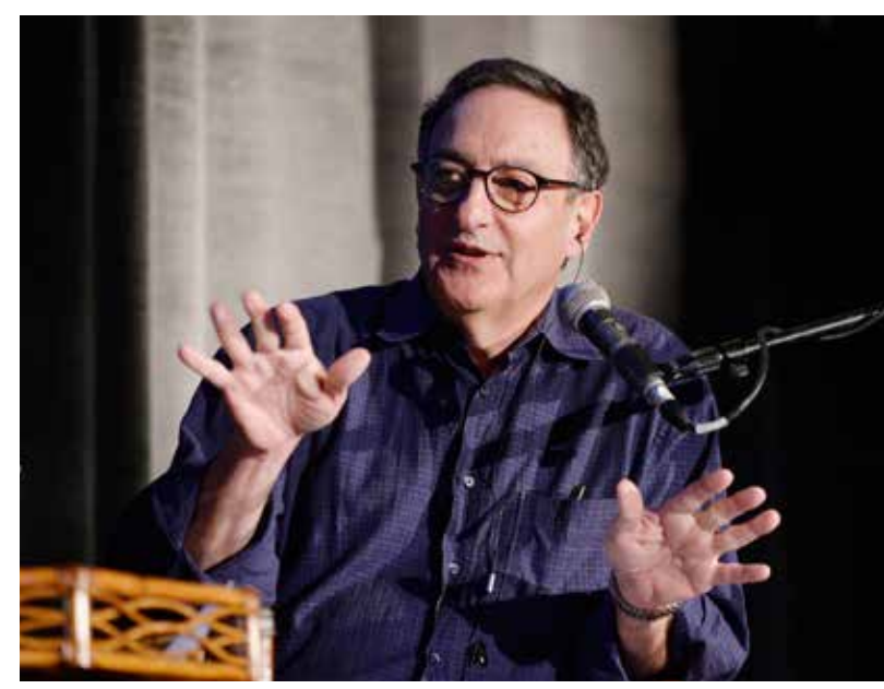
Photo of Ira Flatow speaking at the Aspen Ideas Festival in 2015.

more, she has helped give us direction, giving us a pat on the back when we were doing well, and giving us a pat on the tushy to get us doing better. She has always been a forceful, strong figure, kind of a mother figure we needed as we were growing up."