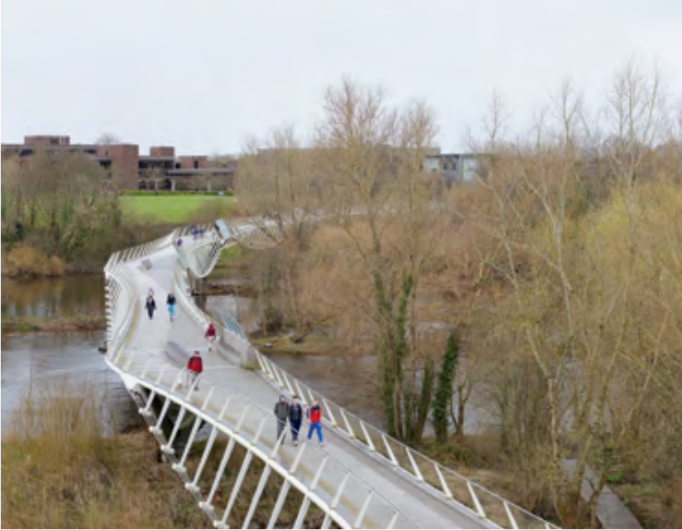
The pedestrian Living Bridge at the University of Limerick crosses the River Shannon, linking the campus in a flowing line.